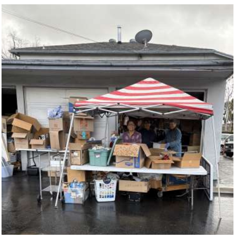
Thank you to the Rummage Sorting Team for their hard work all year round, helping to make Rummage Week a little easier!