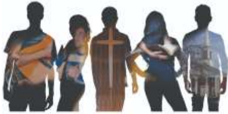
Family & Youth Updates

Mark your calendars: Upcoming events and reminders for Pilgrim's Children & Youth!