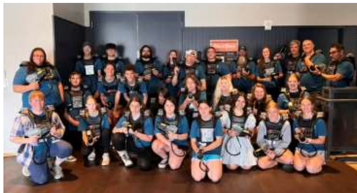
For lunch and silly fun between Worship Service and mission work we went to Whirly Ball for Pizza, Lazer Tag, Bowling and of course Whirly Ball. What is Whirly Ball? It is polo on bumper cars instead of horses. We use ball scoops instead of polo sticks and you have to hit a goal with the ball that is up high like basketball with out the hoop.