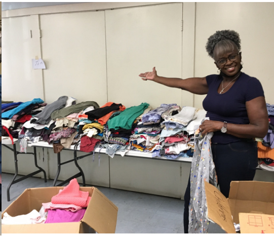
A volunteer from Crossroads happily setting up in the women's wear department