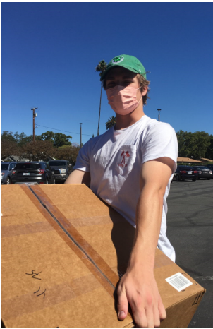
Sigma Chi fraternity member helping move rummage from garage