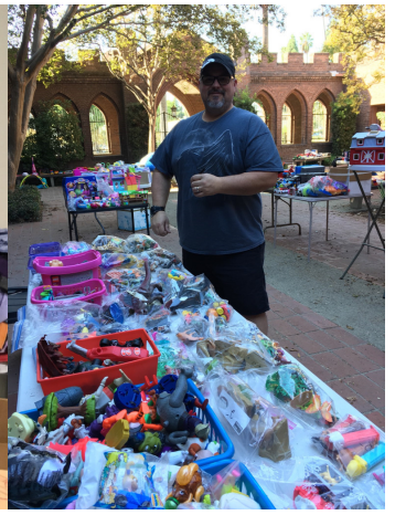
The toy department was outdoors to allow for social distancing