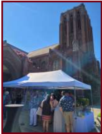
Pilgrims sharing in fellowship at the Morning Mixer.

Membership wants to “Welcome Home” you and the Pomona community each Sunday at 9:15am during our Morning Mixer. We will come together to greet each other, guests and community members as we enjoy sweet breakfast treats, coffee and orange juice as well as activities for all ages finishing up in time to get into church for the musical prelude before 10am Worship Services. We look forward to seeing you.