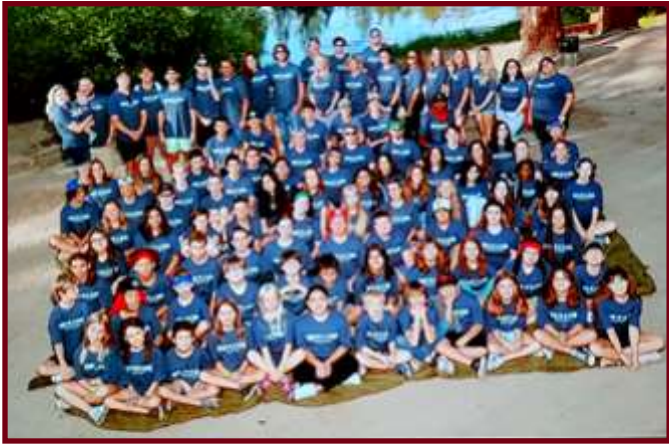
"Fear is a Liar" was the theme for Cedar Lake Camp '21.