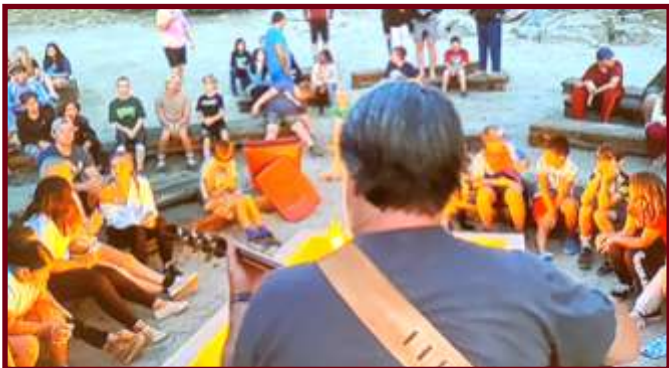
Campfire is filled with fun songs, yummy smores & camp news from Ring Tail and his mischievous cousin Rat Tail.