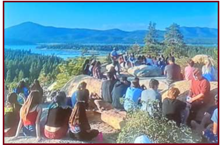
A beautiful view to finish your day in worship and prayer to God for His many blessings.