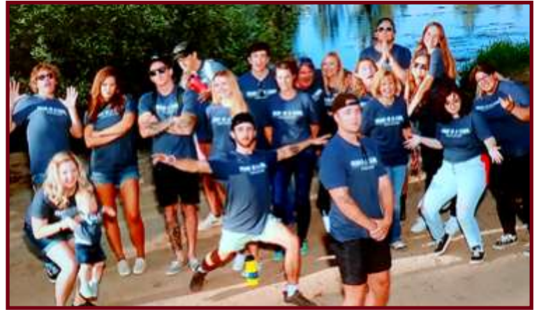
Camp Counselors always have just as much fun as the campers...sometimes more.