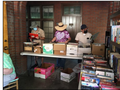
Top: Customers searching for the missing record to complete their collection. Right: Customer caring her haul of treasures she found at the best mini rummage sale around.