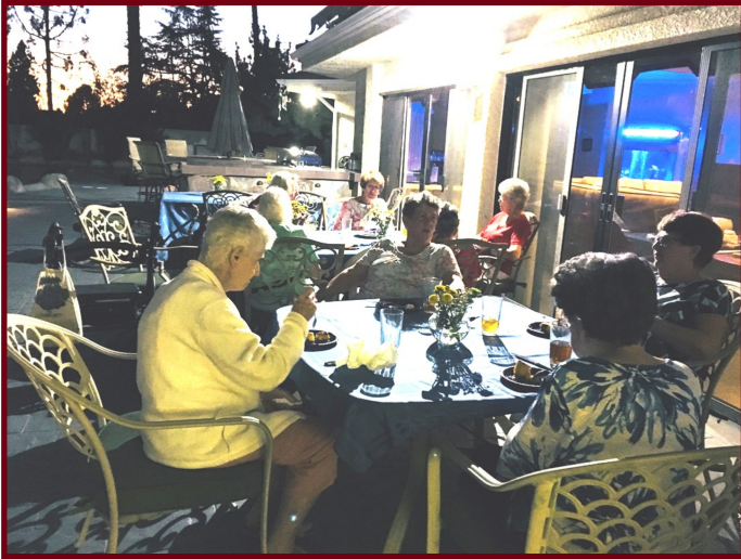
Members of the Friendship Guild share fellowship, friendship, and a delicious dinner at twilight